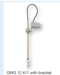
GWG 12 K/1 with bracket

Application To be used as part of an overflow alarm system to avoid overflowing of tanks. Designed for use with battery type tanks made of sheet steel according to DIN 6620-1 type B and rectangular tanks according to DIN 6625-1 welded on site with heights between 1 and 4 m and for plastic tanks, also in battery arrangement (up to 25 individual tanks). Suitable for use in flood hazard areas.