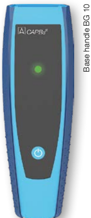
Base handle BG 10