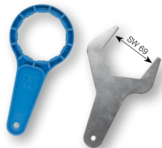
Oil filter spanner Open end spanner

Description For easy and fast operation of the replaceable filter adapter.