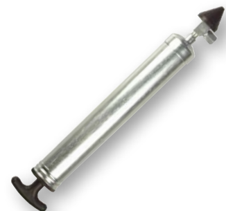
Hand-held suction pump for fuel oil

Description For commissioning and after faults in the suction line system. With check valve/vent valve.