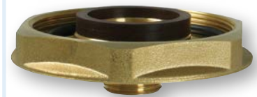
Replaceable filter adapter

Description The replaceable fine filter cartridge can be fitted to all AFRISO filter types (except Z 1/2-500 and V 1/2-500) by means of an adapter and can then be operated both in pressure and suction mode.