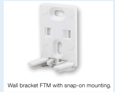
Wall bracket FTM with snap-on mounting.