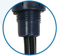
Figure: Euroflex 3 with float

Fitting made of high-impact, weather-resistant plastic. Approved as an isolating piece.