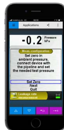
Starting a measurement