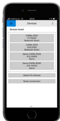
Connecting to CAPBs®